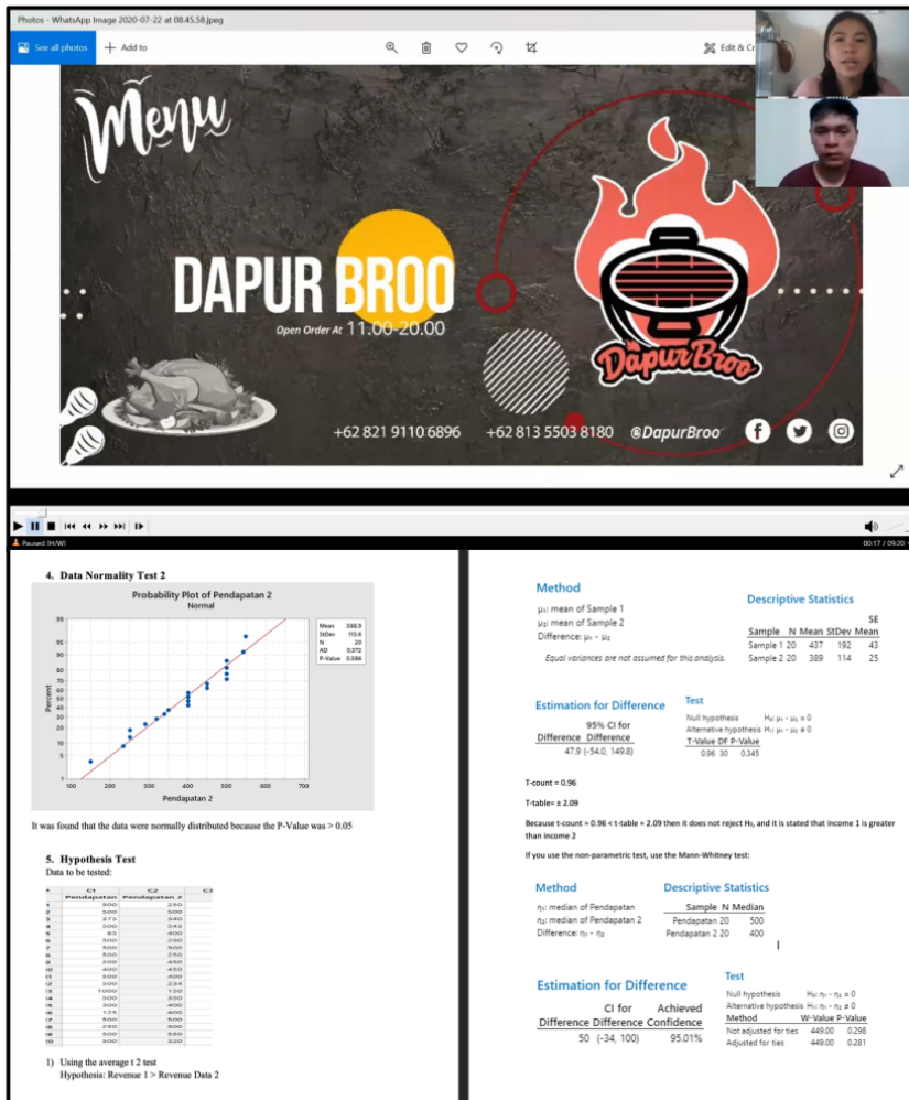
Figure 1. Interview with entrepreneurs and data analysis.

The interview process conducted after the lecture shows student satisfaction with the lecture model and the type of project given. Students are familiar with the use of statistics in an applied and entrepreneurial way. However, students expressed a desire to re-implement the on-site lectures in the classroom.