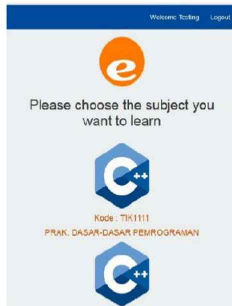
Figure 4. Welcome Page