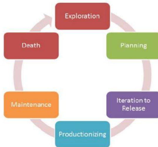
Figure 1. Life cycle of Extreme Programming

Delivering high-quality and reliable software in modern software industry is a must, therefore, choosing the right method for developing software should be carefully planned. By selected wrong models will cost low-quality and high-cost software products [7]. Extreme programming (XP) is a developing software models. XP is a methodology that emerged as a counter-reaction to the ever increasing focus on processes [6]. XP model is an agile software development methodology founded by Kent Beck in 1996. This kind of methodology is a lightweight method that considered suitable for small and medium sized teams between 3 and 10 engineers [12], small project [8] and used for developing mobile application [9]. Five core values of this method namely simplicity, communication, feedback, courage and respect [10] [11]. Every software development methodology has its own life cycle. Thus, developing mobile video learning employ XP methodology has its life cycle which can be described into five phases, which are exploration phase, planning phase, iteration to release phase, Production phase, maintenance phase, and finally death phase [8]. These phases are drawn in figure 1.