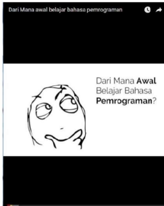
Figure 6. Screenshot Video