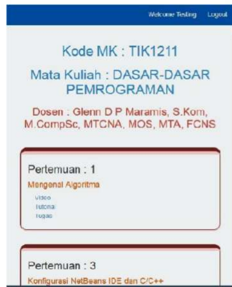
Figure 5. Learning Material

When the user clicked on video link, the video related to the material will shows on the screen. This video is taken and embed in the system. This screenshot video is shown by the figure 5.