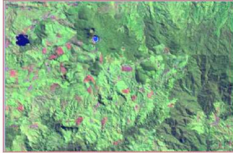
Figure 1: Composite image of the geothermal area X