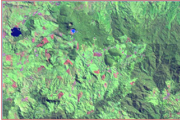
Figure 1: Composite image of the geothermal area X