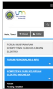
Figure 3. Responsive View in Smartphone