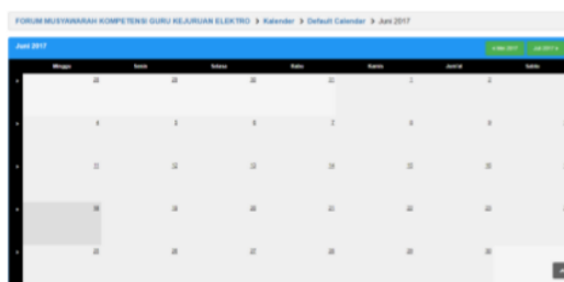
Figure 5. Forum Calendar

In validation step, there are minor revision from material and media expert before website is implement to teachers. The result percentage of data processing from expert judgement and teachers this research show in Figure 6.