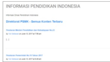
Figure 1. Education Information from Indonesia