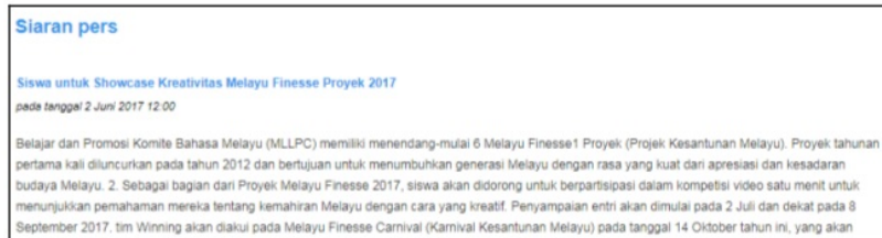
Figure 2. Translate Education Information from Indonesia